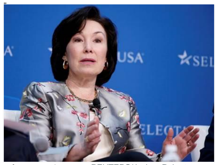
Safra Catz speaks in 2017.